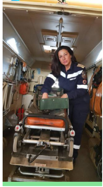
Employee of DG Fire Safety and Protection of the Population