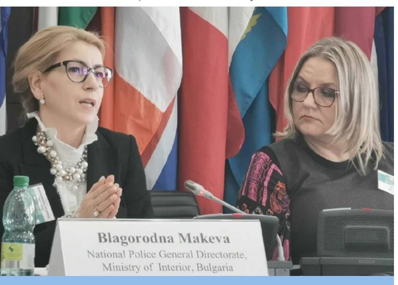
Senior Commissioner Bl. Makeva (Deputy Director of the GDNP) at the final conference of the OSCE on the project "Effective Legal Strategies and Practices for Combating Gender-Based Violence in Eastern Europe" in March 2020

It was adopted in 2008 and focused on sexual violence during conflicts and the link between sexual violence as a tactic of war and the maintenance of international peace and security. It reinforced UNSCR 1325 by recognizing that sexual violence was often widespread and systematic practice that might impede the restoration of international peace and security.