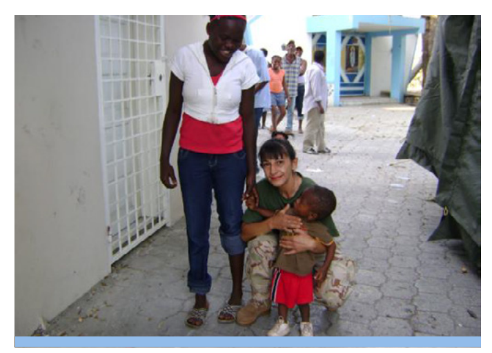
Bulgarian military support team in Haiti