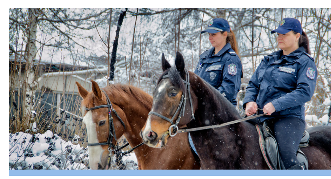
Employees from "Horse Police" division at the "Specialized Police Forces" Department - SDol