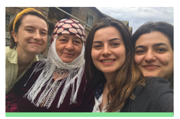
Eurasia Partnership Foundation in implementation of a project with Bulgarian ODA to support Yazidi women - victims of conflict in Armenia

WOMEN, PEACE AND SECURITY NATIONAL ACTION PLAN | 2020 - 2025 |