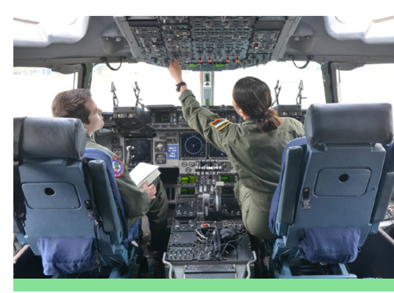
Captain Zhasmina Hristova – the first Bulgarian female pilot at the Strategic Airlift base

Peace and security are globally shared responsibilities.