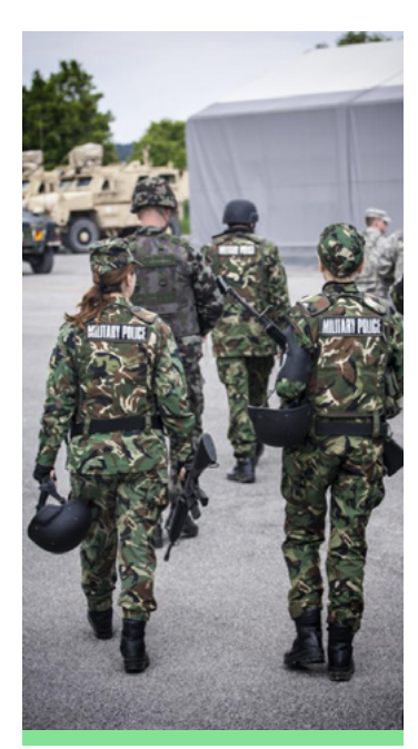
the Bulgarian Military Police mixed team