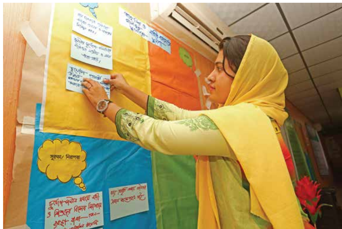
Photo: A woman in one of the district level consultations providing her recommendation on 'Relief and Recovery'

Bangladeshi female peacekeepers contribute to reducing gender-based violence and to preventing conflict in areas where they serve, providing a higher sense of security especially for women and children.<sup>32</sup> In addition, it is important to ensure that pre-deployment training for all personnel both female and male engaged in peacekeeping operations includes gender awareness, orientation on the women, peace and security normative agenda, and strategies for the prevention of sexual exploitation and abuse.