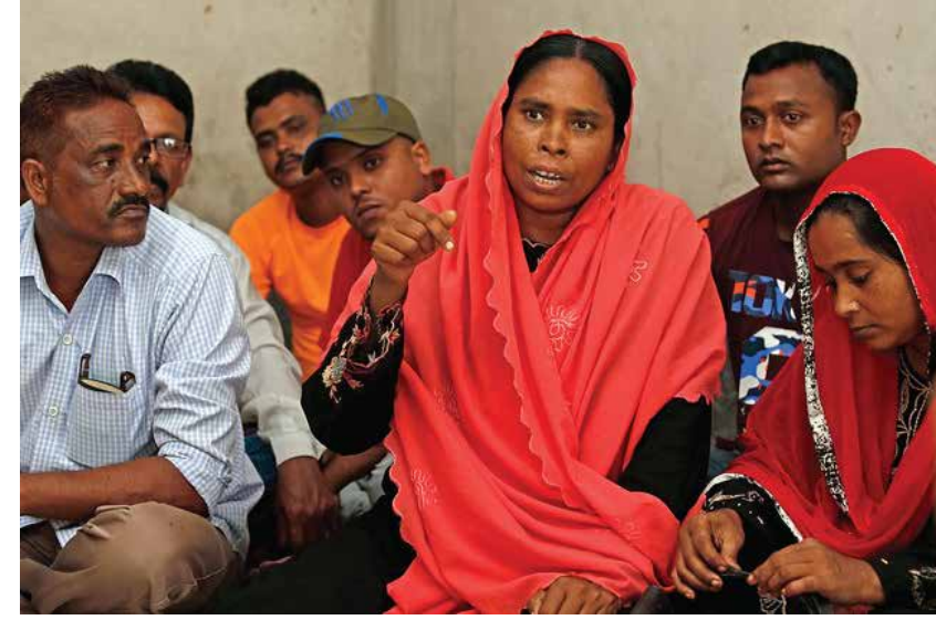
Photo: A woman from grass root level, expressing her opinion on engaging more women in community based discussions and decision making processes

In the Chittagong Hill Tracts, there was a special emphasis on the need to continue strengthening the participation of women from ethnic minorities in the Local Government Council/Hill District Councils<sup>26</sup> and groups such as Para Nari/Women Development Groups to effectively interface with these councils, law enforcement and customary institutions.<sup>27</sup>