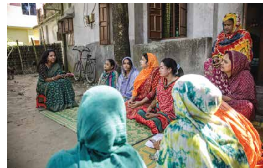
Photo: Group of women discussing in a courtyard meeting about how they can prevent communal conflict and any form of violence against women that affect social cohesion

Lack of tolerance towards diverse religious and ethnic groups may often cause intercommunal and inter-ethnic conflict. Fostering the culture of tolerance and peace, and building bridges across different groups, including with a gender perspective, is a key tool of conflict prevention.